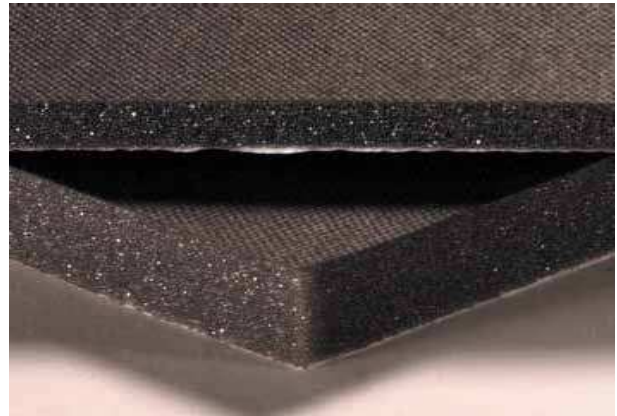
Measurement according to DIN-EN-ISO 10534-2 impedance tube

The fleece surface is resistant to soiling and splash water. The material is widely resistant to petrol and engine oil splashes and is easy to clean. The surface sealing protects from mechanical damage. Excellent ageing properties.